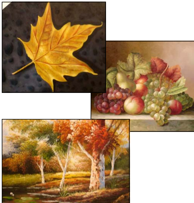
Northville Gallery 123 E. Main 248-465-9630 www.northvillegallery.com