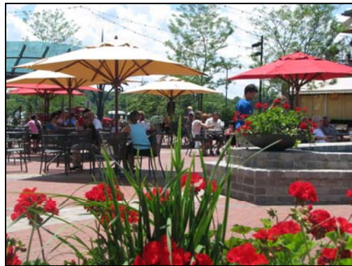
Join us, won't you?

parades, concerts, and fun activities for the whole family.