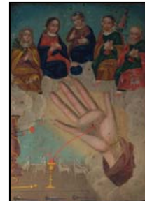
The Omnipotent Powerful Hand