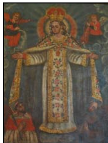
The Virgin Of Mercy With Saints

The exhibition will feature works by anonymous artists and artisans with the major focus on 18th century religious paintings from Latin America and 19th century Mexican Folk Retablos - small paintings of images on sheets of tin.