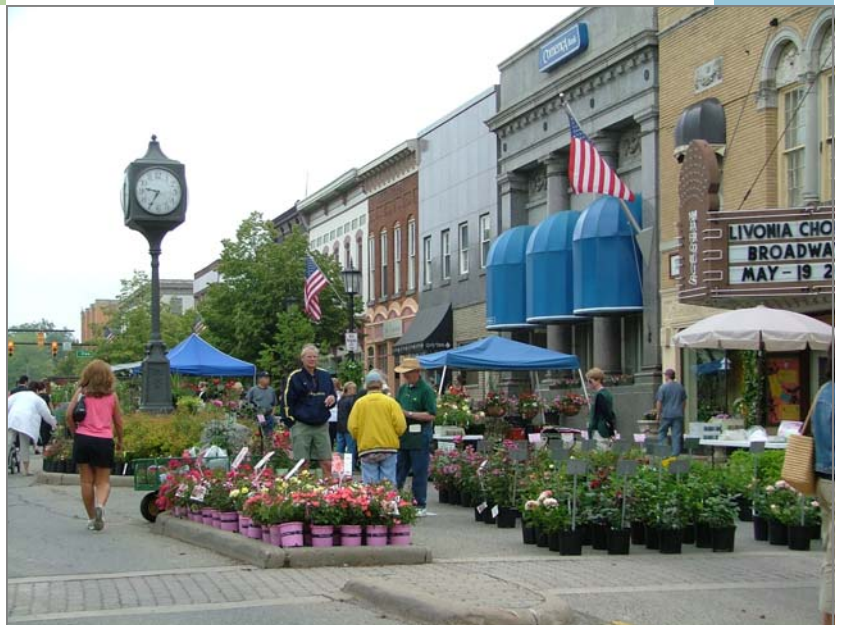
23rd Annual Flower Sale May 27-28

Gather at The Bee's Knees, 149 E. Main, to pick up your camera and join the hunt. Return to Bee's Knees for creative fun and a Fairy Celebration which includes painting a fairy figurine, making a fairy necklace and tattoos. For Reservations call 248-347-6718. $20.00 per child, costumes optional.